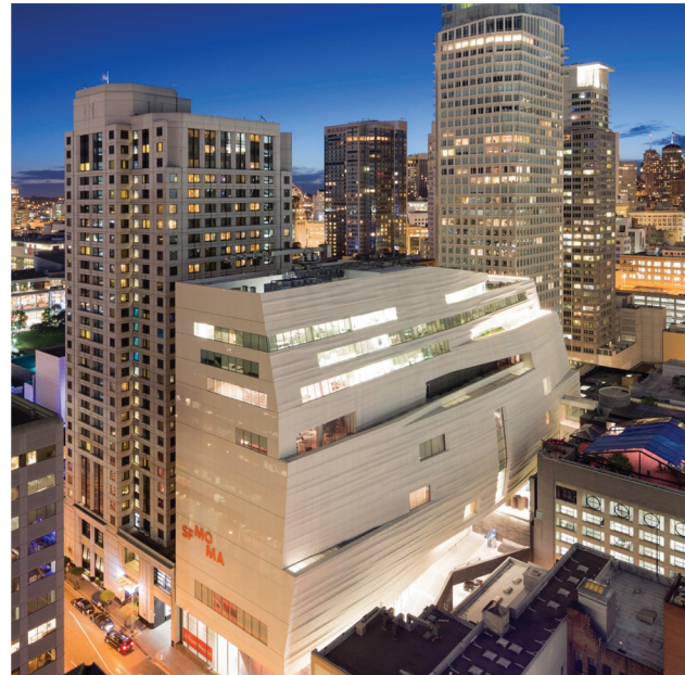
San Francisco Museum of Modern Art expansion