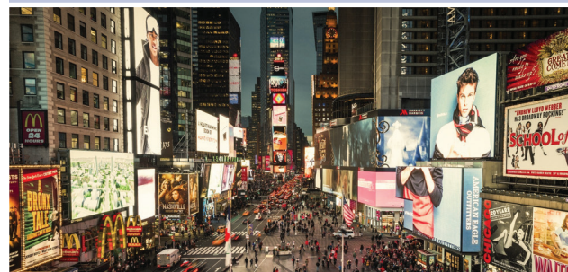
Reconfiguration of Times Square pedestrian plaza