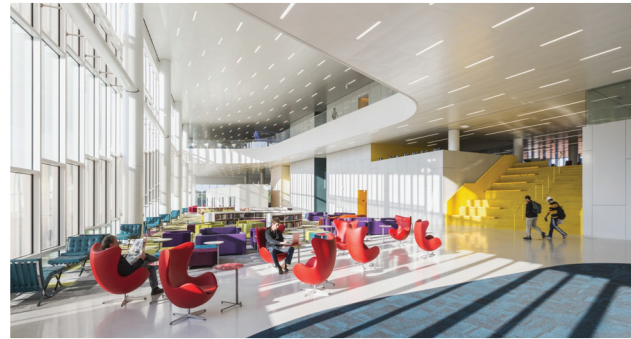
Hunt Library at NC State University